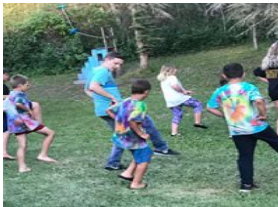
Campers learning to Ukrainian Dance.

Campers take part in Ukrainian dancing. No experience necessary!