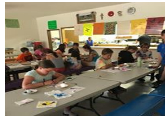
Campers making Pysanka.

Campers learn how to make Easter Eggs (Pysanky), bake Kolachi (bread), embroider, tie-dye t-shirts, paint rocks, etc.